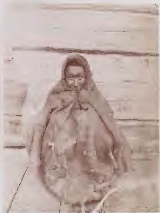
| 32. Favorite Position when at leisure. |